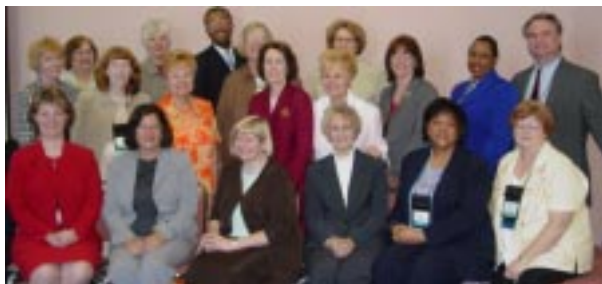
NASBE Members at NBEA Tampa

An application form is included in this newsletter. You MUST be an ACTE member.